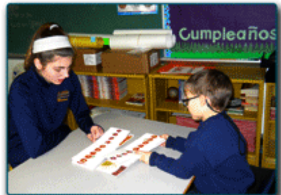
Above: 7th graders and 1st graders at St. Angela Merici School explore language and literature with a team approach

As a special surprise, room parents from the 1st grade supplied fresh fruit from the story. Students were able to enjoy a healthy snack of strawberries, oranges, apples, and watermelon. Once students had finished their poster and eating, they were able to work together on a word search with the food from the story.